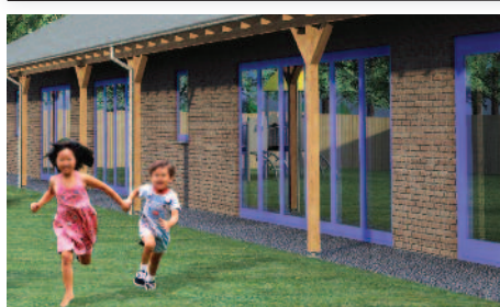
Architect's impression of new Sixpenny Nursery